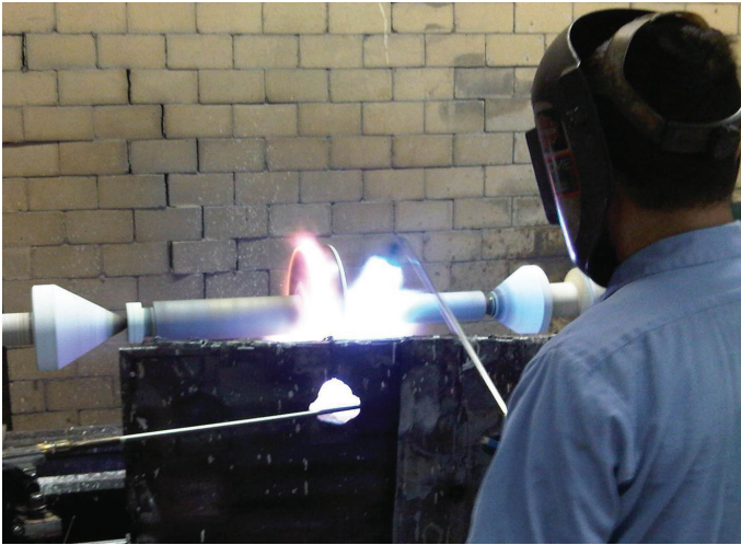
Fusing Colmonoy® 52 SA onto B.O.P. Ram.