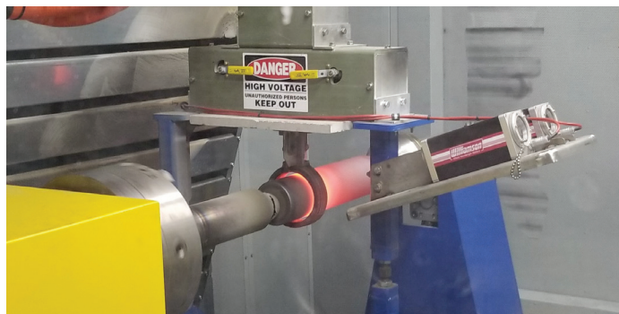
Automated induction fusing

For more information, visit spraywelder.com .