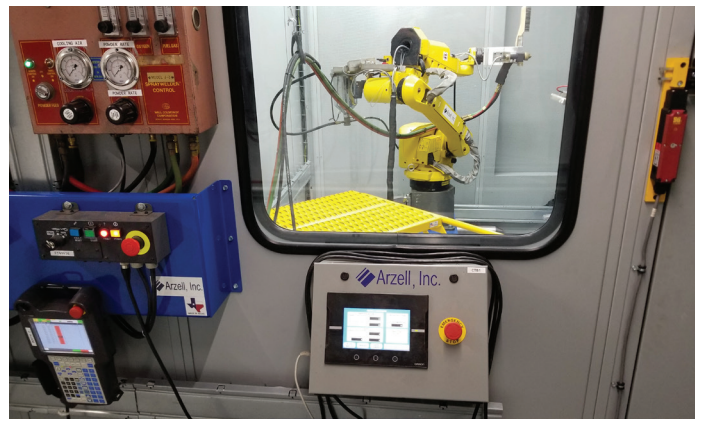
Electrical control valve system

Due to a high demand from customers to automate their processes, Wall Colmonoy team is dedicated to custom integration of automation and equipment and offers an automated Spraywelder™ Solution.